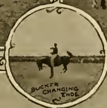
BUCKER CHANGING ENDS